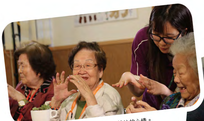
輕鬆有趣的認知訓練活動，為長者帶來愉快的心情。 Cognitive training with fun element will bring happiness to the elderly.

To cater for the pressing and diversified needs of the elders, we are dedicated to provide more effective and person-centred services; we will strive for innovative service development. Capacity building in our team, especially in enhancing knowledge and skills in handling the Behavioural and Psychological Symptoms of Dementia and in end-of-life care would be our significant tasks in the future. We would keep on rendering demand-driven community care services, educating the elders to prepare for their end stage of life and creating more possibilities for the elders to lead their active and peaceful life.